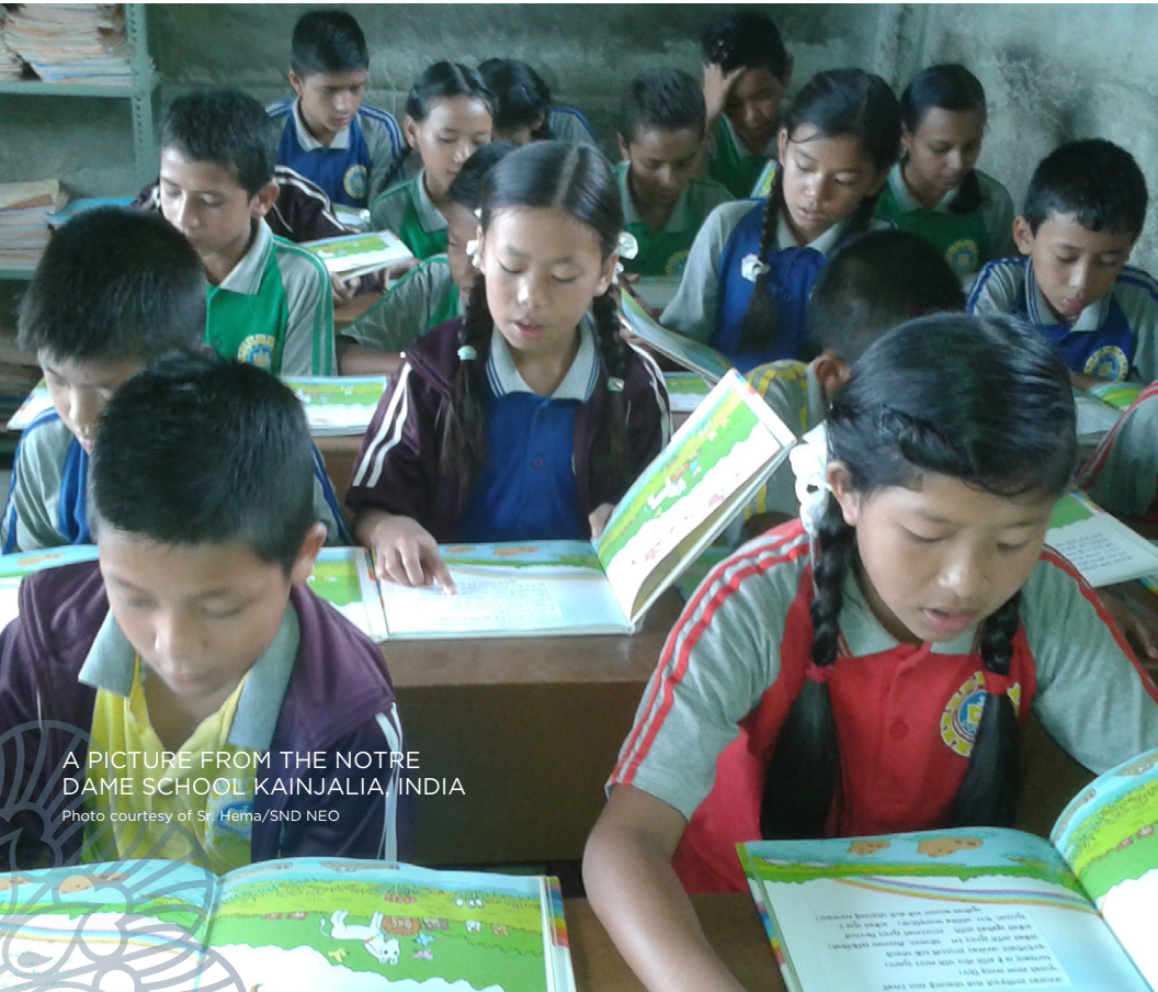
A PICTURE FROM THE NOTRE DAME SCHOOL KAINJALIA, INDIA